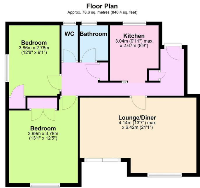
Total area: approx. 78.6 sq. metres (846.4 sq. feet)